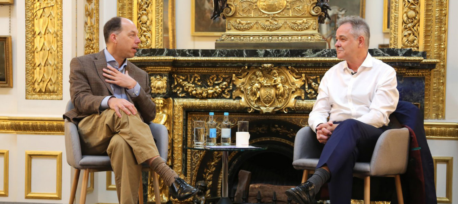
Stephen Quake (1991), Sir Jeremy Farrar